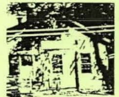
Island Hall former community hall

Hasten thee to the Community Center on Saturday June 8 at 1:30 pm! An enthusiastic group of islanders has established Peaks' first Historical Society. They'll be on hand to explain the whys and wherefores of the new Society. Come and share your ideas for historical activities and programs that the new Society could undertake. Volunteer your time and talents! Become a dues paying member! For this effort to succeed we need the support of the community at large. We invite you, your friends and neighbors to enjoy light refreshments while discovering Peaks Island's diverse past. FMI: peakshistory@gmail.com